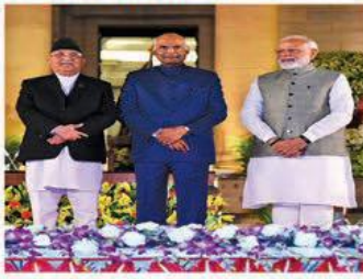
Rt. Hon'ble PM of Nepal Mr. KP Sharma Oli with Hon'ble President Shri Ramnath Kovind and Hon'ble PM Shri Narendra Modi during Swearing-in Ceremony of newly elected government.

मैं भारत के 130 करोड़ नागरिकों के सर भूषणकर के नमान करता हूँ। लोकतांत्रिक विचर में 2019 का ये जो मतदान का विचर हो चुका है, ये अपने आप में लोकतांत्रिक विचर के इतिहास की सबसे बड़ी घटना है, पूरे विचर की ये सबसे बड़ी घटना है। देश आज्ञा हुआ, कितने लोकसभा के चुनाव हुए, लेकिन आज्ञा की बाद, इतने चुनाव होने के बाद सबसे अधिक मतदान इस चुनाव में हुआ है। और वो भी 40/42 डिग्री नमी के बीच में, ये अपने आप में भारत के स्वतंत्रताओं की जाहलकाना, लोकतंत्र के प्रति भारत की प्रतिबद्धता, पूरे विचर को इस बात को रोजिस्टर करना होगा, पूरे विचर को भारत की लोकतांत्रिक शक्ति को पहचानना होगा। इस अवसर पर मैं, इस लोकतंत्र के उत्सव में, लोकतंत्र के धारित विन-विन लोगों में बहिरान विन है, जो लोग सायास हुए हैं उनके परिहार में मुझ है। और वो भी 40/42 डिग्री नमी के बीच में, ये अपने आप में भारत के स्वतंत्रताओं की जाहलकाना, लोकतंत्र के प्रति भारत की प्रतिबद्धता, पूरे विचर को इस बात को रोजिस्टर करना होगा, पूरे विचर को भारत की लोकतांत्रिक शक्ति को पहचानना होगा।