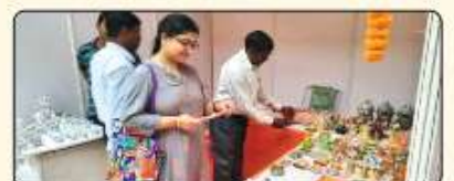
8. Exhibitions of ODOP, NMC & Handicraft