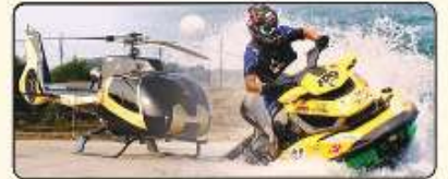
3. Helicopter Rides/Water Activity