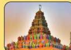
Shankar Viman Mandapam