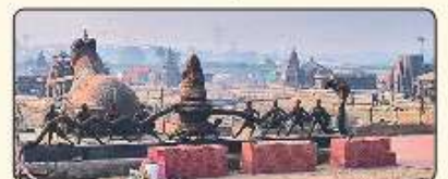
9. Shivalay Park