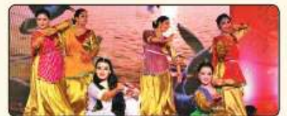
5. Cultural Performances