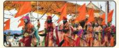
2. Mahakumbh Akhara Tour