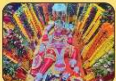
Shri Lete Hanuman Ji Corridor