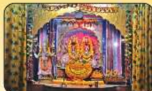
Dwadash Madhav Temple