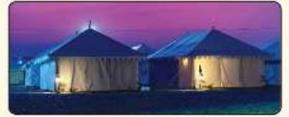
1. Tent City