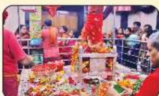
Alop Shankari Devi Temple