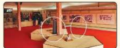
7. Kala Gram