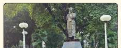
10. Heritage Walk