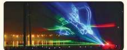
4. Water Laser Show