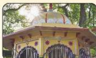
Mankameshwar Temple Corridor