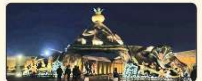
6. Sanskriti Gram