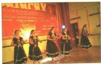
Cultural Evening, Students Union.