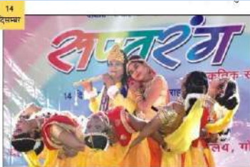
सांस्कृतिक संस्था - सप्तरंग में विद्यार्थियों को इन्द्रधनुषी प्रस्तुति