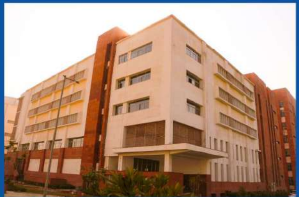
Faculty of Arts and Design