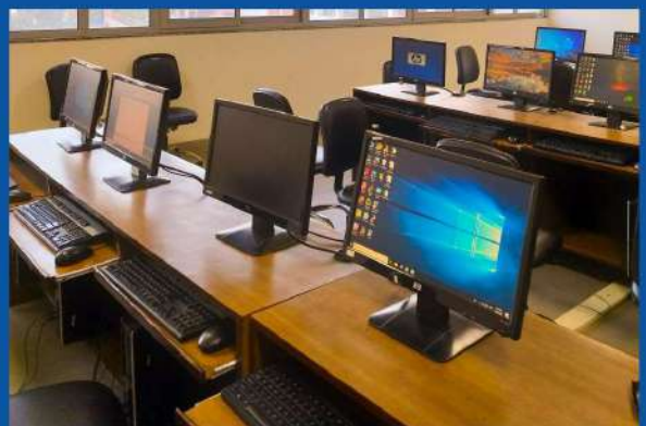
Faculty of Mathematical Sciences