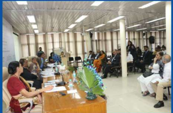
Faculty of Legal Studies