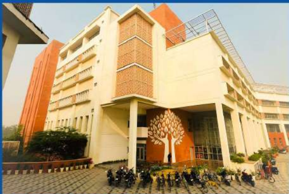
Faculty of Social Sciences