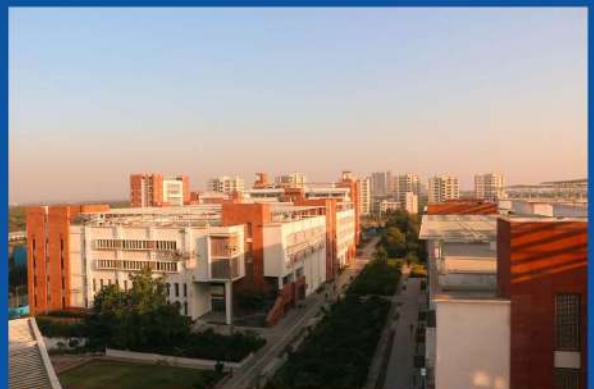
SAU Virtual Campus