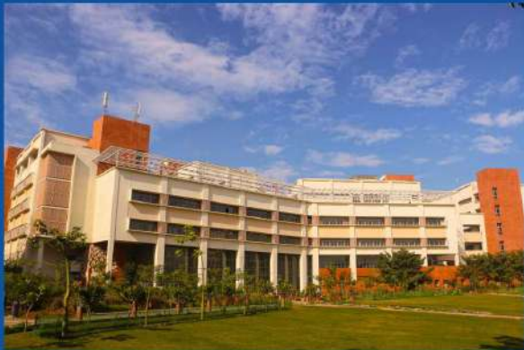
Faculty of Economics