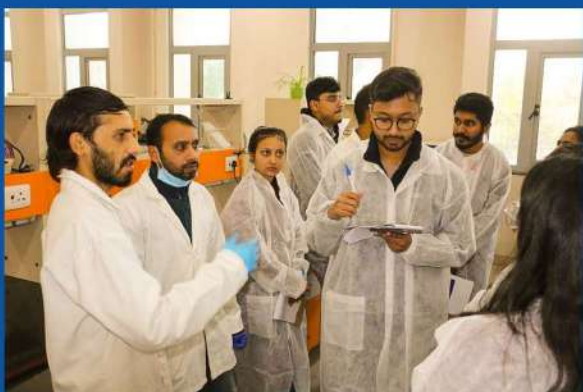
Faculty of Life Sciences and Biotechnology