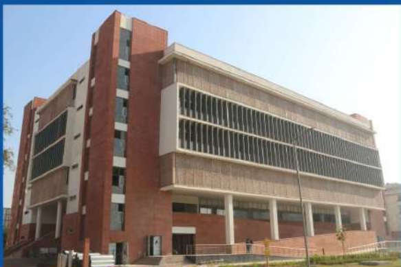
Faculty of Engineering and Technology