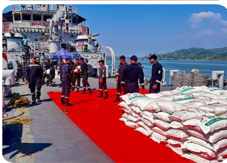
First Responder in times of crisis

India launched Operation Brahma to provide necessary support, including Search and Rescue (SAR), humanitarian aid, disaster relief and medical assistance, following the devastating earthquake that struck Myanmar on 28th March 2025. Being the First Responder in times of crisis in the Neighbourhood, Operation Brahma is a whole-of-government endeavour by India to respond to widespread destruction in Myanmar. As on 1 April 2025, six aircraft and five Indian Naval ships have delivered 625 MT of Humanitarian Aid and Disaster Relief (HADR) material. India's ongoing efforts under Operation Brahma reflect its commitment to respond swiftly and in full measure to natural disasters in her Neighbourhood. As a First Responder, India stands with Myanmar, a key partner of our Neighbourhood First and Act East policy.